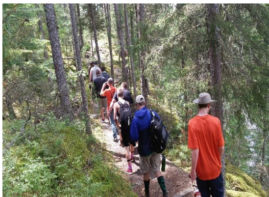
The Boys negotiate Vermillion Gorge in the Superior National Forreest. What a Great Hike!

On the trip to Cache Lake three troops combined to have one shared experience. People from Three different geographical locations, different leaders, different scouting experiences, different home lives. Different. Yet in the space of 72 hours together, they became brothers on a shared journey. I am honored to be a part of the Phantom Troop 258. Diverse in its creation and yet made single by acceptance and driven by success. I hope the Memory of this Journey lives on in all of you and serves as a reminder that different is what makes it fun, different is what makes it work. Embrace the differences and grow stronger from the experience.