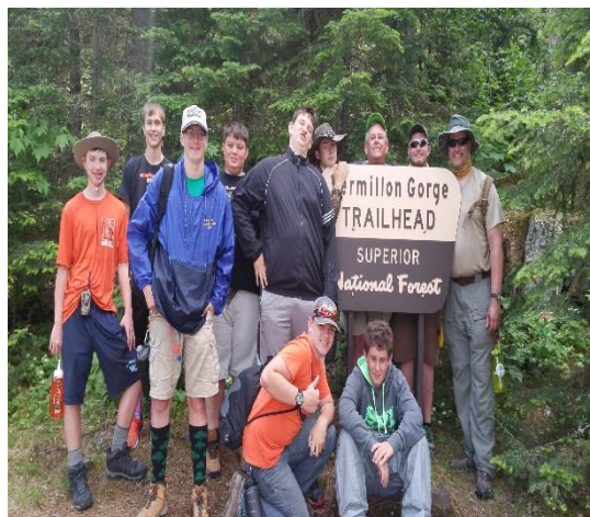
Here we are, Let's get started!