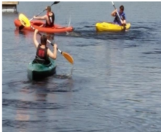
Kayak Attack! It's all for One! One for All!