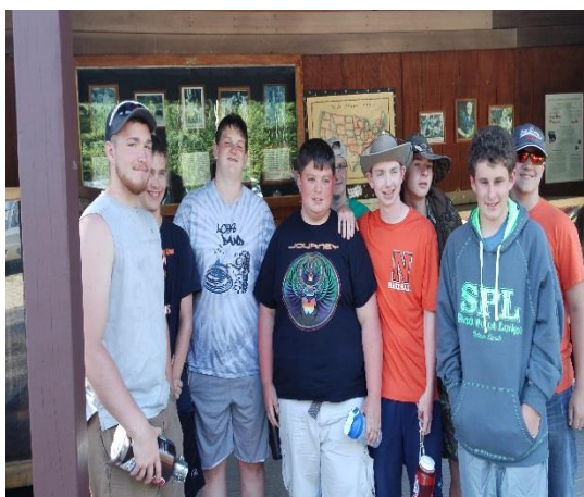
At the Bear Sanctuary - Side Trip!